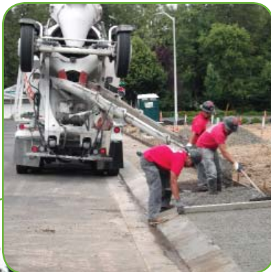
After the fence was completed, the sidewalks were poured.