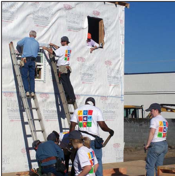
Yahoo! employees help wrap a house at Ramble Glen

Because of the sheer volume of people who come out and volunteer for eight hours, space prevents us from listing them here, but we cannot thank you enough!