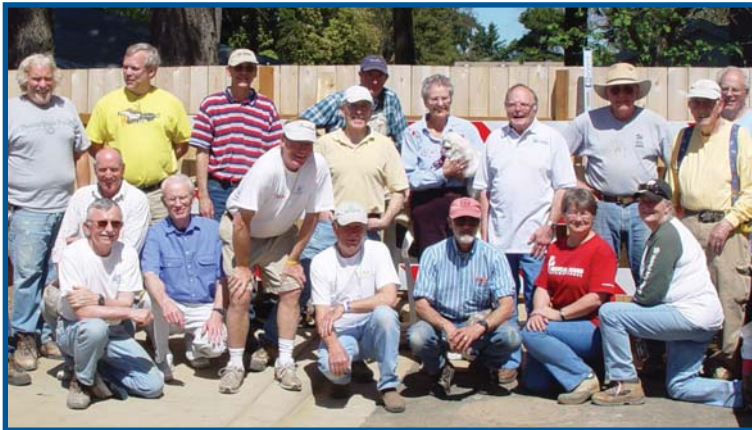
“The Regulars”