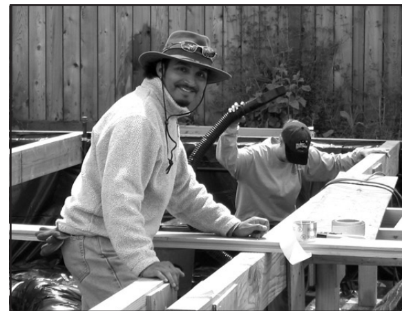
Volunteers working on the job-site.